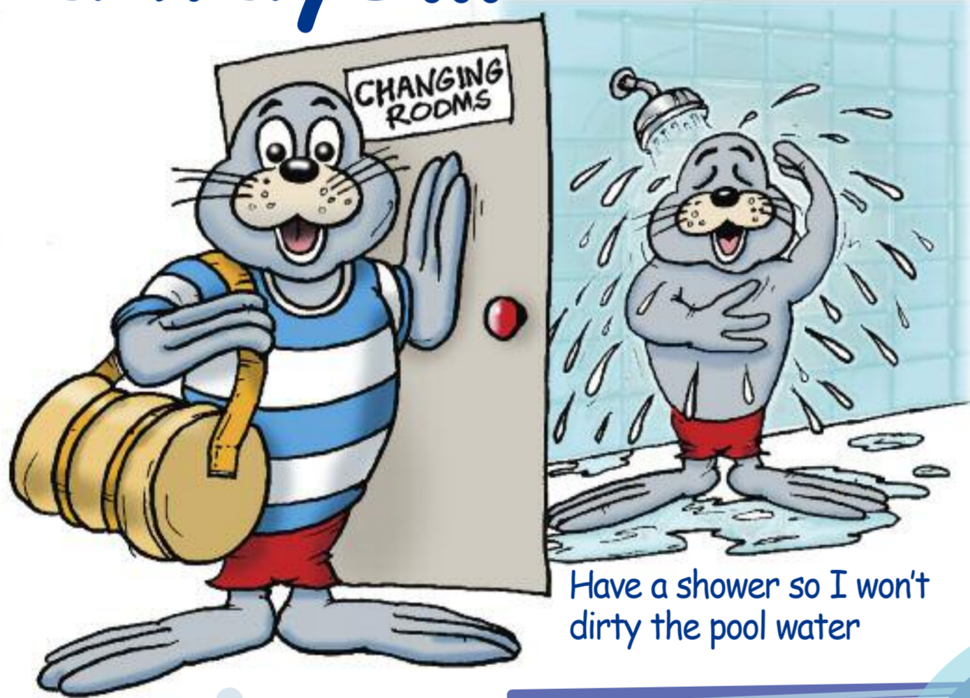
Have a shower so I won't dirty the pool water