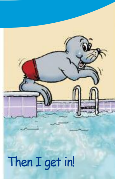
Then I get in!