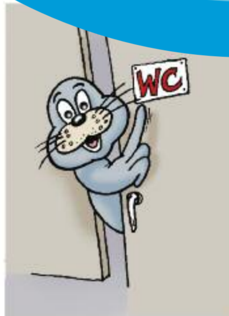
Go to the toilet